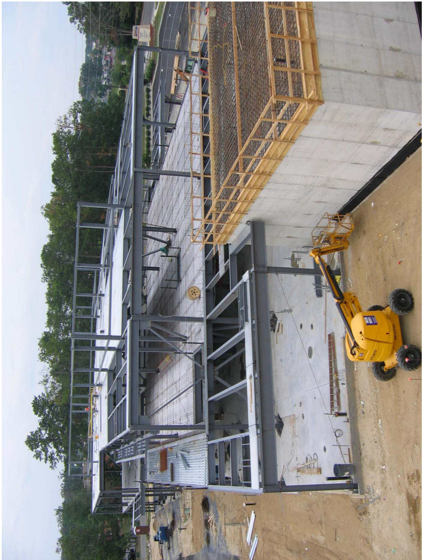
Photo 3: Linear accelerator vaults integrated with steel frame of overall building.