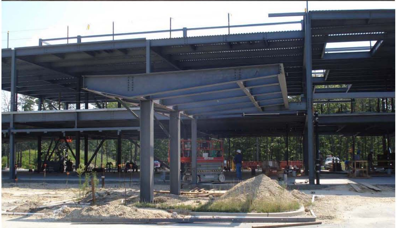
Photo 1: Cantilevered steel North entrance canopy during erection and the final product.