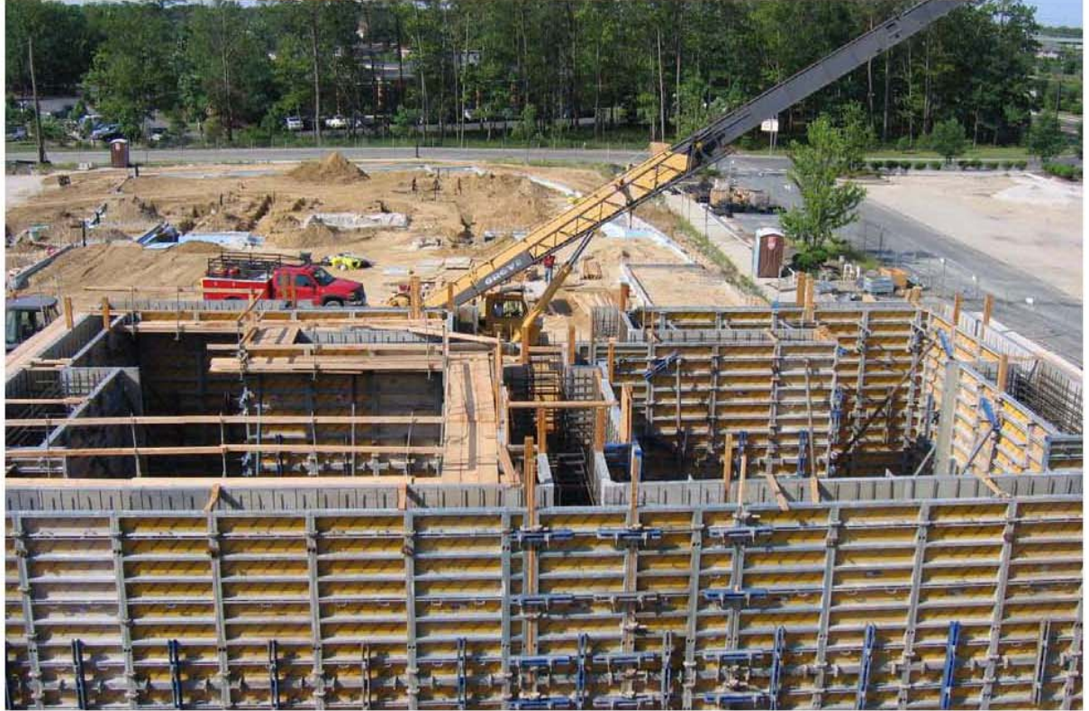
Photo 5: Linear accelerator foundations and wall forms being erected.