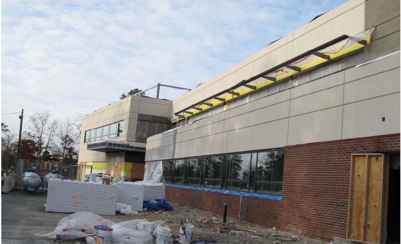
Photo 4: South façade showing sunscreen elements being constructed.