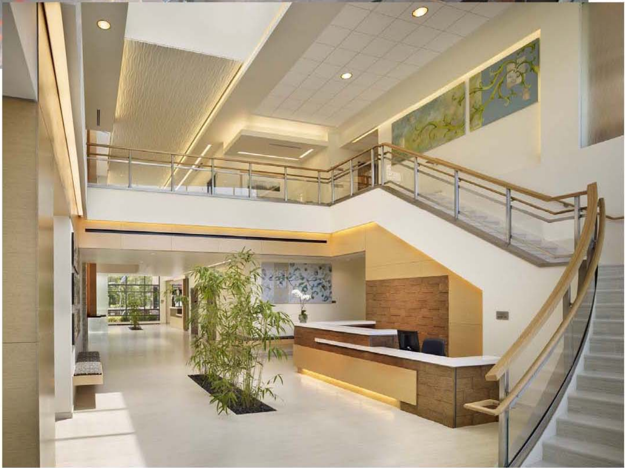
Photo 2: grand lobby atrium and stair during construction and the final product.